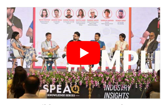
How to Build a Beauty & Personal Care Brand in India: Focussing on Innovation, Packaging & Quality.

An engaging platform featuring thought-provoking speakers and interactive sessions. Dive into discussions highlighting the strategic significance of private brand partnerships, delve into the best practices of retailers, D2C brands, and suppliers, and elevate your strategic vision. The SPEAQ Series unites brand builders, D2C startups, investors, contract manufacturers, and retailers, fostering discovery, collaboration, and the advancement of India's contract manufacturing ecosystem.